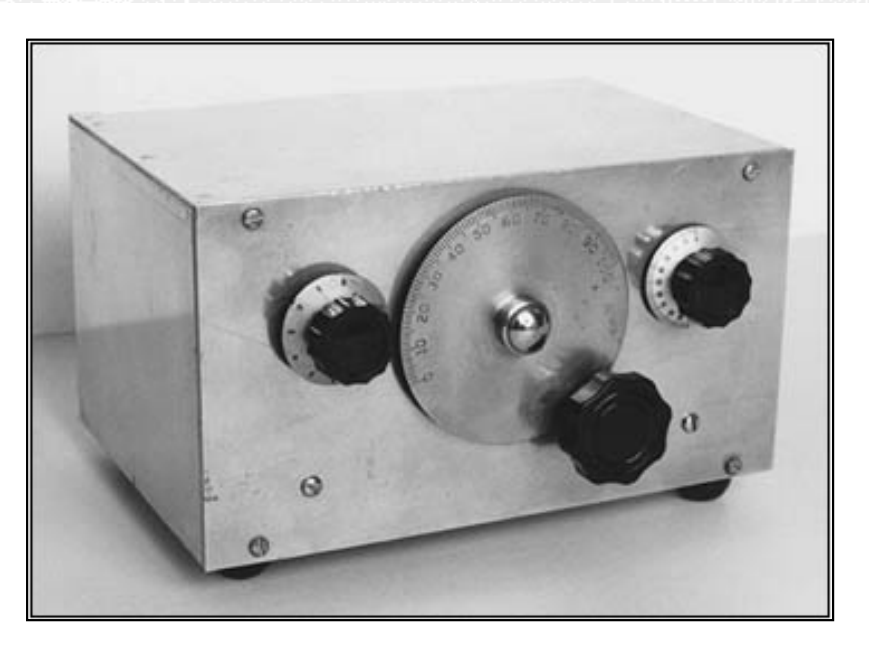
Figure 1. The Novice Special receiver in its restored state.

The set was in rough shape, but the price could not be beaten. The back panel of the cabinet and its three dials were missing. The front panel was in poor condition. On a positive note, all of the electrical components seemed to be there, including two tubes and a plug-in coil for 80 meters. And a definite plus was the fact that the radio came with its companion power supply.