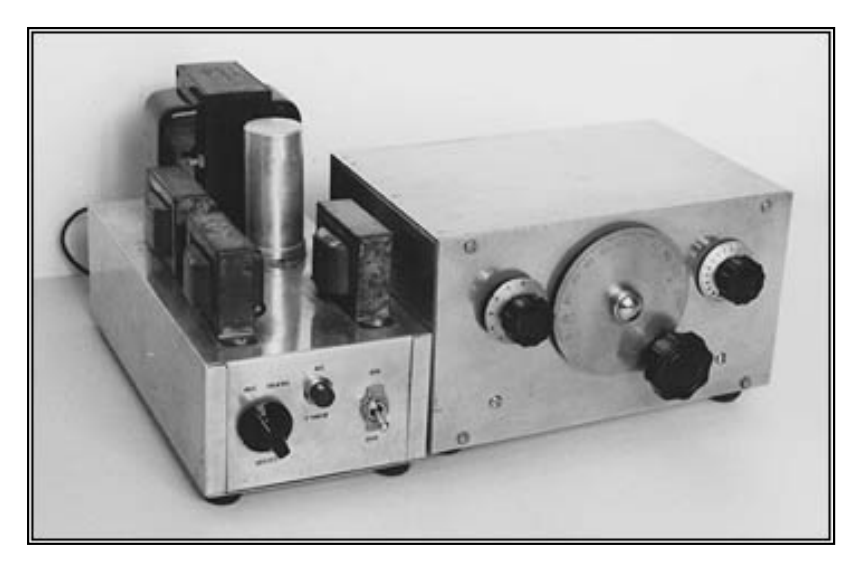
Figure 3. The Novice Special receiver and its power supply. The power supply has been modified as explained in the text.

I tried to improve the set's performance by using the RF amplifier portion of a vacuum tube TR switch described in the 1964 edition of the ARRL Handbook and found that it was most useful on 40 meters. The radio would probably be adequate for QRP (low power) work, but I have not used it for 2-way communication.